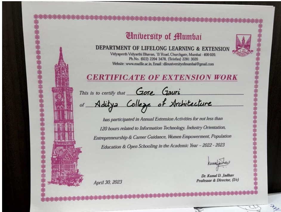
Title: Certificates awarded to students on Completion of DLLE activities.